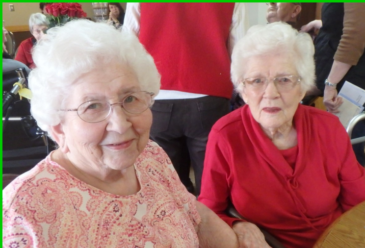
Our residents enjoying our Valentine's Day Party !!