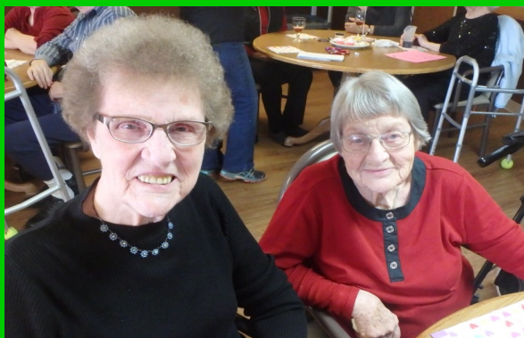
Thank you to the Benton Community Keystone Elementary kids for coming up and reading to our residents!!