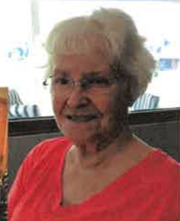
A few of our "Good Looking Grandmas" to celebrate the day!!!