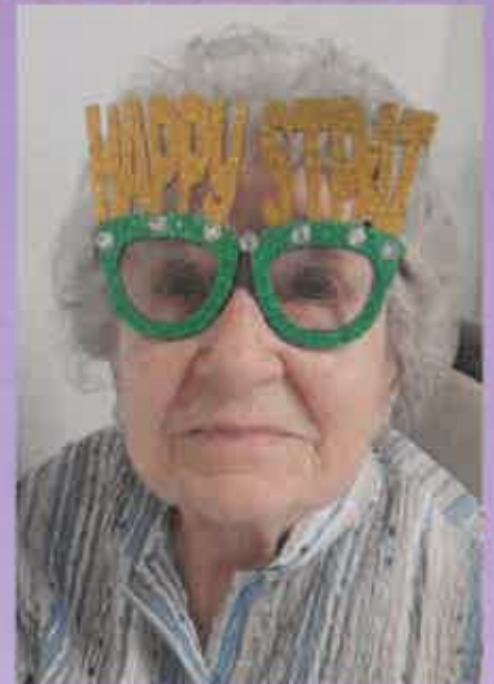
Celebrating St. Patrick's Day!!!!