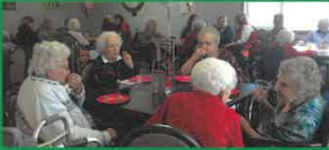
Our residents enjoying our Valentine's Day Party