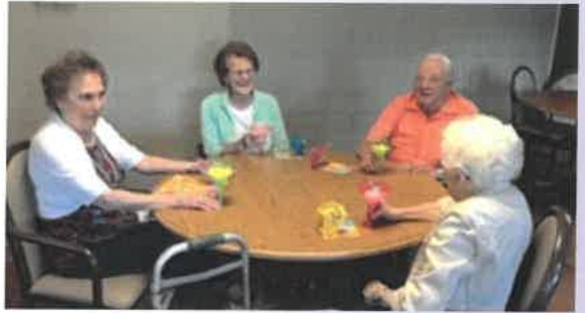
Celebrating Pina Colada Day!!