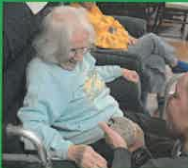
Thanks to Camp Courageous for bringing their furry friends to share with our residents!