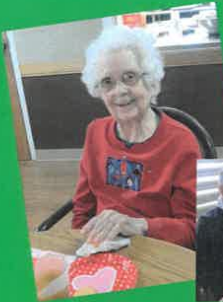
Our residents enjoying our Valentine's Day Party