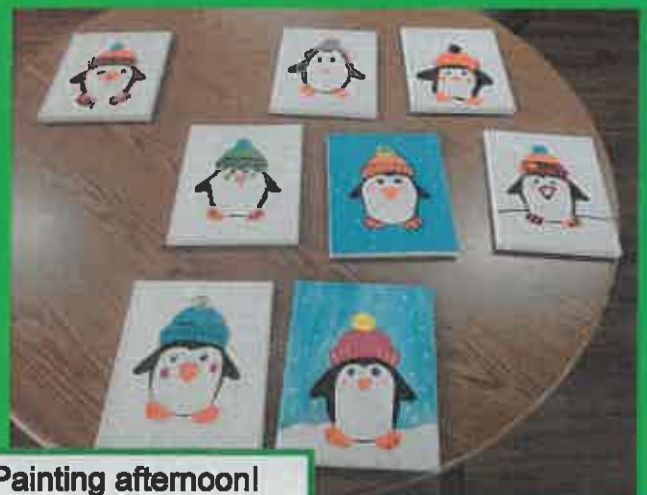
Enjoying our Wine & Painting afternoon! Thank you to all our artists!!