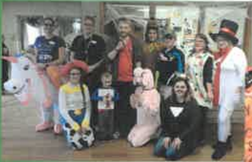
Celebrating Halloween with the elementary students and staff families!!