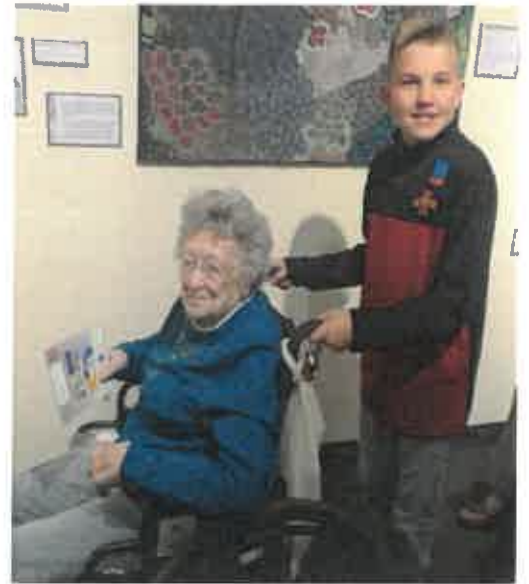
National Czech Museum