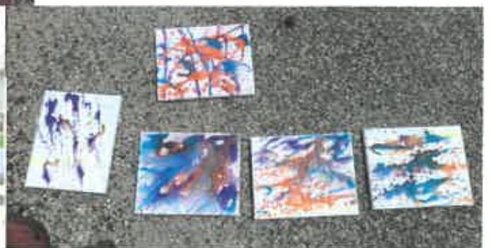
Hog Roast Day