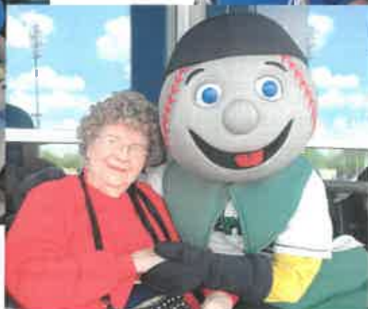
Cedar Rapids Kernels Game